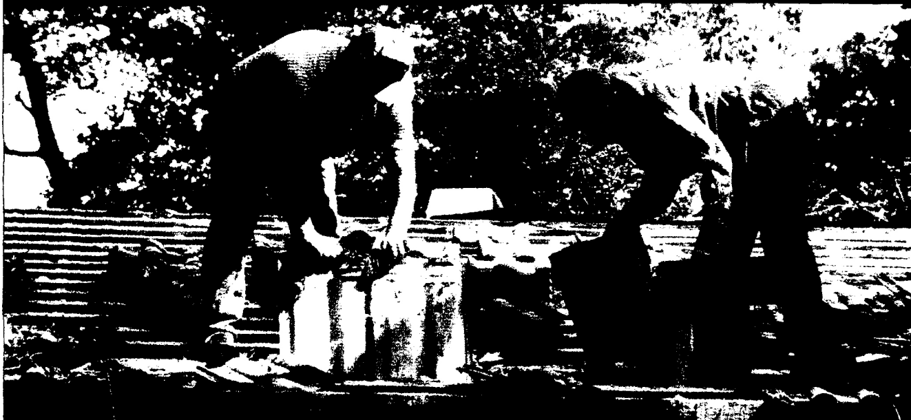
Braun's Roofing crew inspecting the roof deck at the tear-off stage.

Hurricane season is upon us and coastlines will once again become besieged by tropical storms and hurricanes.